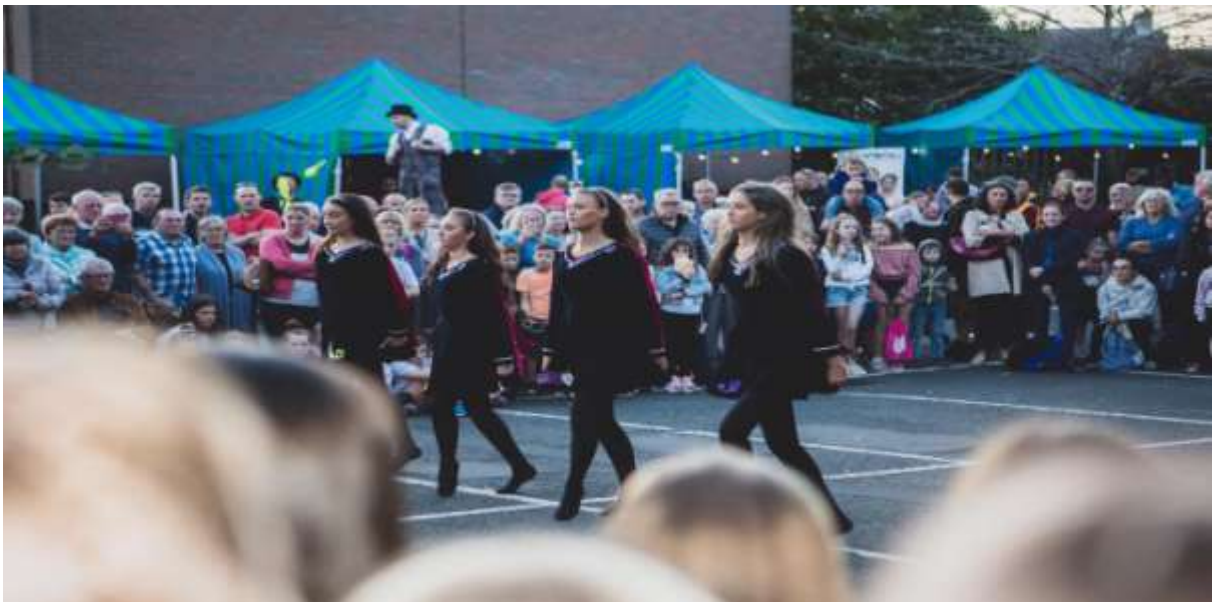
Irish dancers at Culture Night

We hope that the coming year will see our ambitions to run creative activities and projects throughout the year progress with a broader menu of events. The success of Culture Night illustrates that there is an appetite for arts programming in the town, and we will endeavour to expand these activities in the years ahead.