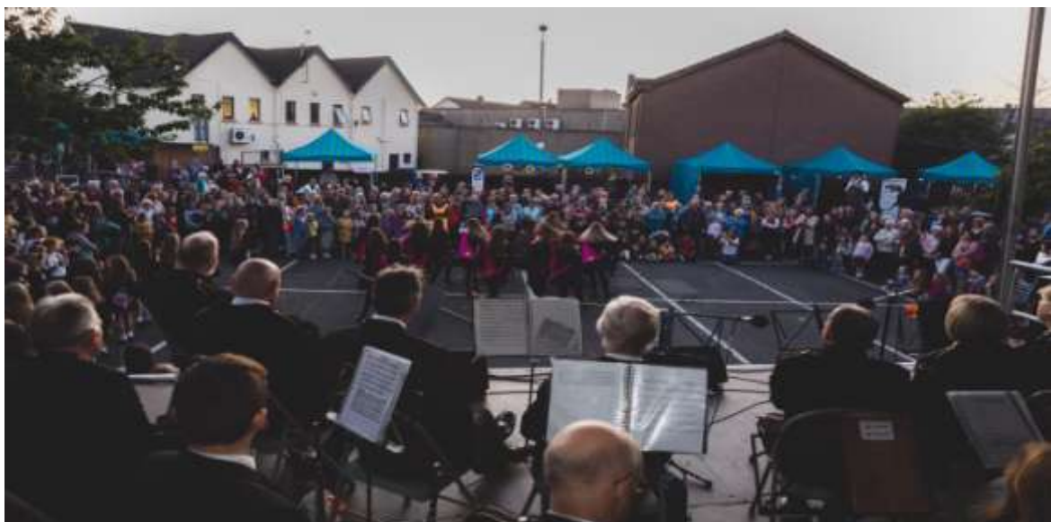
Scene from stage at Culture Night

This year's creative activity centred around Culture Night which took place on Friday 21st September. Two significant changes were made to the event's format of previous years. Firstly, we decided that the emphasis of the programming should be geared towards young people. And secondly, that we should mount the activities in the Church Road car park, moving away from the High Street. These decisions were taken as a result of the competition for audiences from Belfast's Culture Night, alongside our financial and staffing limitations.