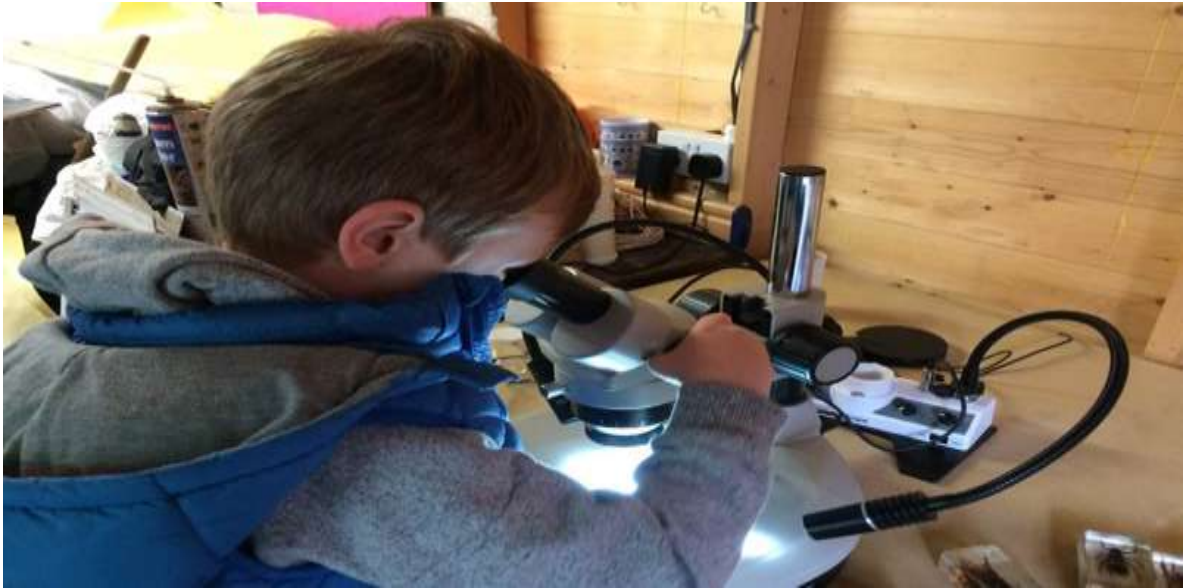
Young Scientist at Bug Hunt

One of the most popular and satisfying activities for our members is wood turning. We were able to purchase a small bench lathe from our own fundraising but members' aspirations and expertise began to increase. We wished to purchase a wood turning kit (with a chuck and other turning tools). We also identified the need for some expert tuition for those members who want to develop their skills but lacked the help to do so. We were successful with an application to the Allen Lane Foundation for a grant of £700 which allowed us to purchase additional woodturning equipment and have members trained in using the lathe which improved both health and safety and the quality of work produced.