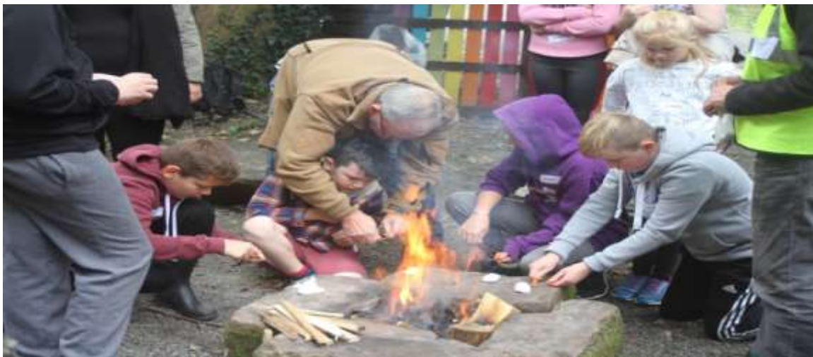
Forest School event in Redburn Country Park

Two successful workshops, facilitated by Conservation Volunteers, were held with Camphill Community Glencraig around the themes of building bird and window boxes. A family Easter Party took place at the Stable Yard following on from the successful Christmas and Halloween parties. We were successful with Micro-Grant application from the Community Foundation for £900. The series of six family ecological events funded by the Micro-Grant scheme were delivered successfully and reached their target audience. The programme was varied and interesting. The feedback from participants was uniformly excellent. Some families came to all six events and most came from the local community which had been part of the target. This helped in the social cohesion aspect as families got to know each other from event to event and built a real sense of community.